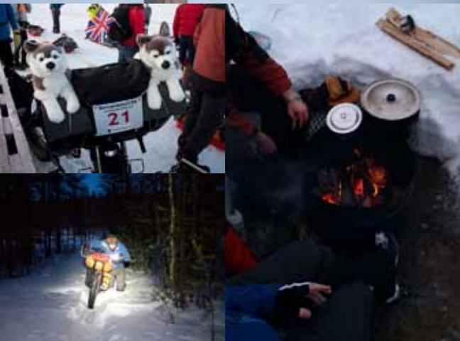
The snowshoe groomed sections were tough, filled with deep snow you could only push through