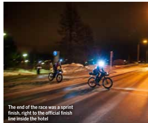
The end of the race was a sprint finish, right to the official finish line inside the hotel