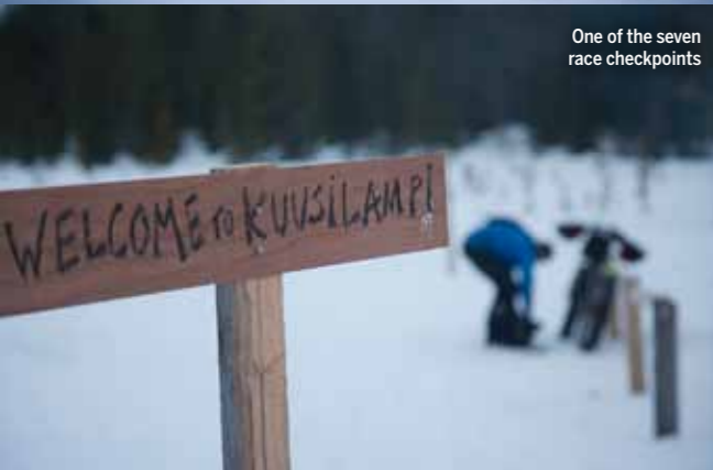
One of the seven race checkpoints