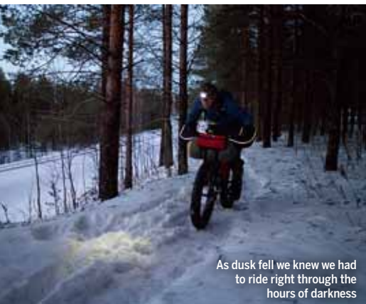
As dusk fell we knew we had to ride right through the hours of darkness

I burst through the door shouting for the time like a crazy man, punch drunk and delirious. When the answer comes – 23 hours, 59 minutes – I collapse into the nearest chair. Bloody hell that was close, and one hell of a way to pop my racing cherry! 🍒