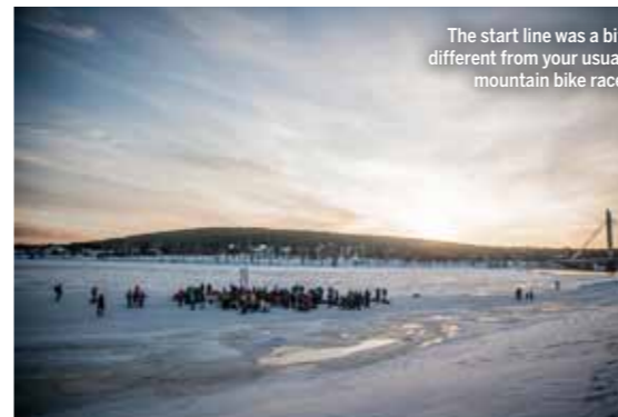
The start line was a bit different from your usual mountain bike race

I see my first fatbike angel – the perfect impression of a rider and bike in the snow at